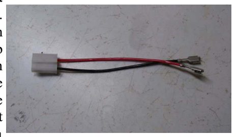
Fiero wiring harness with snap on connectors.

Fiero pump has a connector. snap is There enough room for the snap connector when installed, but the terminal the on ground wire must be changed for a ring tongue end so it can be attached