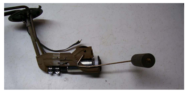
Pump assembled mounted on the bracket. Note that two new holes must be drilled for the screws.