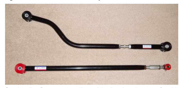
Spohn Performance adjustable Panhard arms for Hbody cars. The arm for '75 model year cars is on top, the '76 on the bottom.

one for #3173 ('76) and #0212 ('75) later this year, I figured I would order both to try and also to review for the