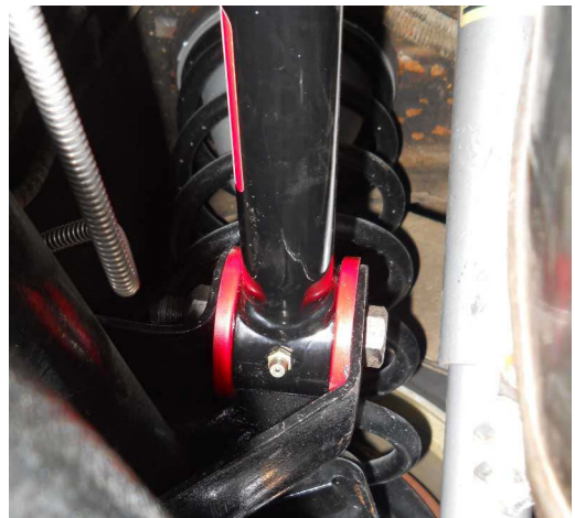
Grease fittings are easily accessible on both ends of the arm.

I tightened up the locking nuts and I was good to go. It was a scream to see the read-end moving as I turned the