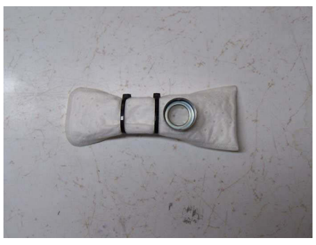
Fiero sock with zip ties attached.

Unfortunately, the design of the filter sock is also different between the CV and the Fiero. The sock for the CV was