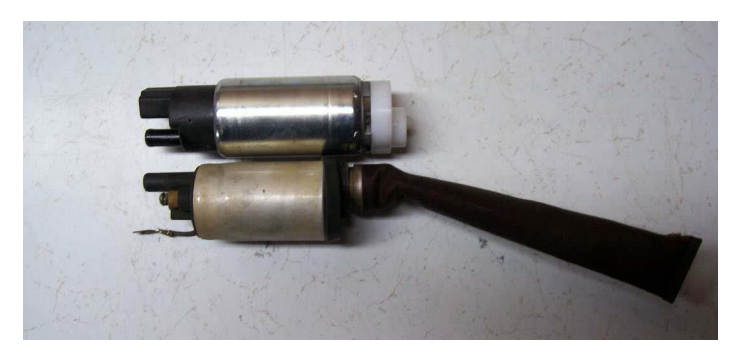
The low pressure CV pump next to the Fiero pump. As you can see, the Fiero pump is about 3/4" longer than the CV unit.

The bracket holding the pump is in two pieces, held together with screws in the middle to allow for removal and installation. The rear portion of the bracket needs to be extended to allow for the extra length of the Fiero pump. However, at that point the bracket will interfere with the stop tab for the fuel gauge float arm so it must be ground down for clearance as pictured below.