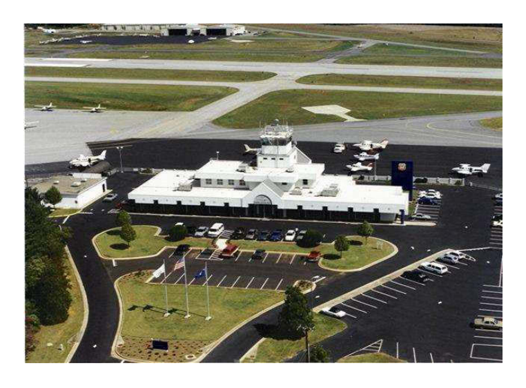
1:30 – 3:30PM - CVOA Concours judging at Greenville Airport in the hangar next to Runway Café

3:30-4:00PM - Ice cream social at airport