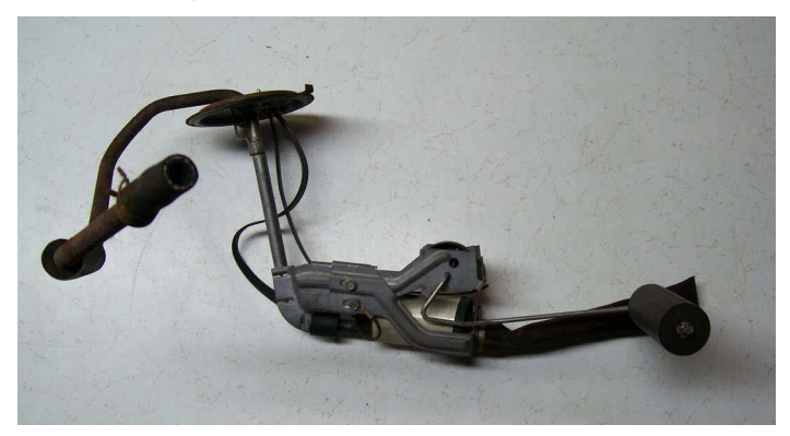
Stock configuration of the low pressure pump and the fuel gauge sender as removed from the tank.

I removed the tank from the car and the sender/pump unit from the tank. The sender is removed by tapping the lock ring in a counter-clockwise direction with a punch (I use a flat end chisel) until it releases.