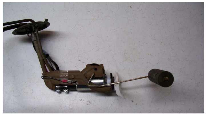
Assembled fuel pump and sender unit with the float lever in the empty position.

pair of zip-ties spaced far enough apart that the sock would be squeezed and allow enough clearance for the float lever in between when it is in the "empty" position.