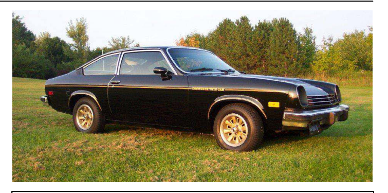
1975 Vega Panel Express 1977 Vega Hatchback 1976 Cosworth Vega #2396

Due to age-related medical issues, conditions, and problems, I need to sell off most of, if not all of my Chevrolet Vega cars. As well as all the accessories, spares and miscellaneous parts. First would be a 1975 Vega Panel Express that was intended for light commercial use. It is a two seater and is flat from the back of the seats all the way to the rear door. Spare wheel well is just inside the rear door and there is a large, deep trunk space under a removable cover just behind the seats. It has GT wheels, GT steering wheel, custom instruments, a retrofitted T-50 5-speed transmission and GT suspension. The car is white in color and this particular model of Vega is very rare.