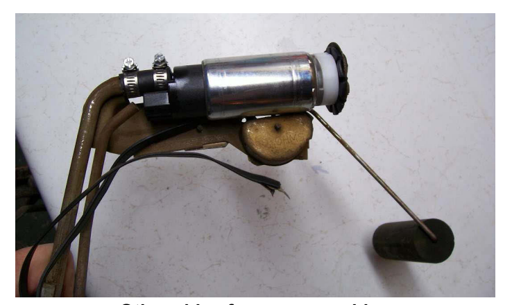
Other side of pump assembly.

The hose connecting the pump to the steel line must be shortened from what is supplied in the pump kit. The nipple on the pump must contact the steel line when assembled, otherwise there won't be enough overlap on the bracket to be able to attach the halves together.