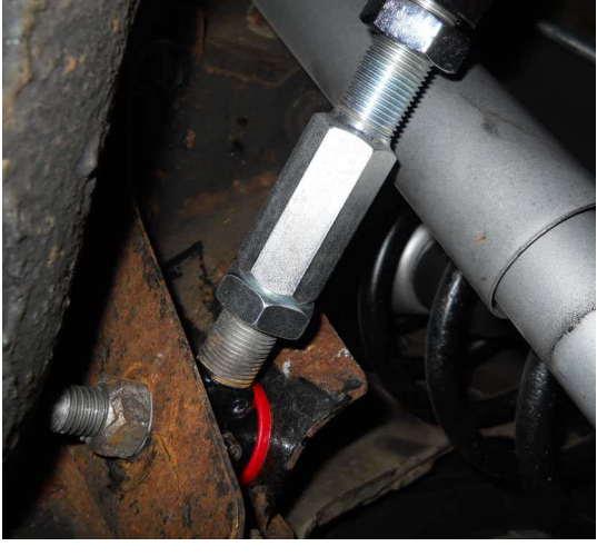
vard Adjuster threads and sleeve of the and Spohn Panhard arm. The picture angle tape measure makes it look like shock clearance is and I was tight, but it is really not.

I tightened up the locking nuts and I was good to go. It was a scream to see the read-end moving as I turned the